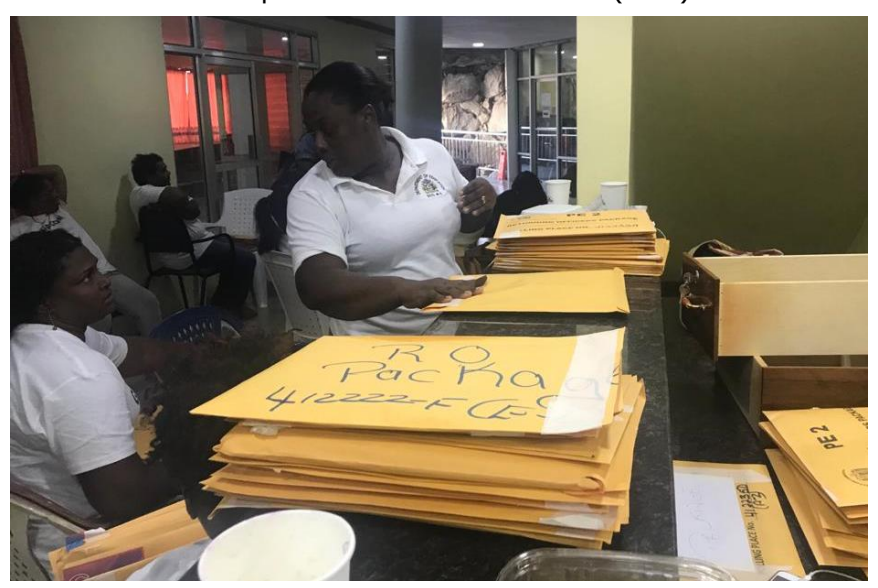
Packages for the RO Office