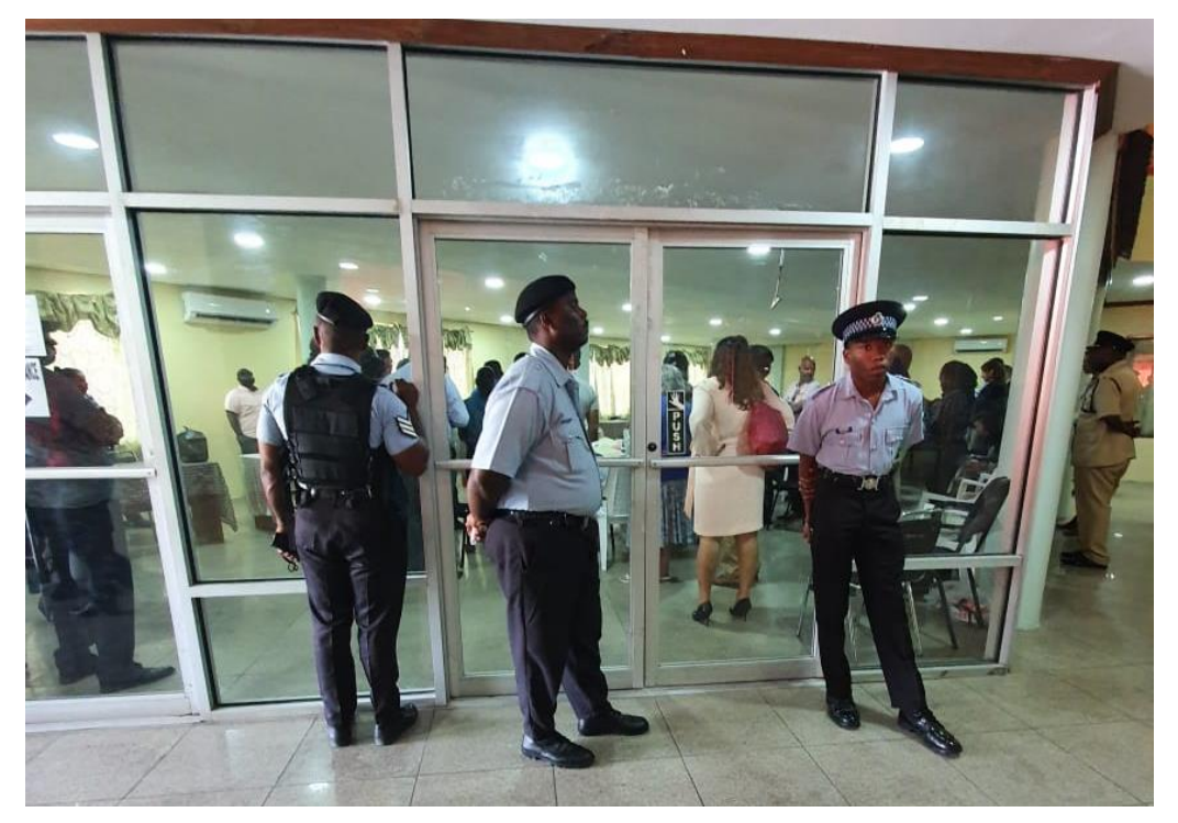
Tabulation room shut and guarded on Myers' instruction

(a) When she arrived at the Ashmin's building, she saw barricades around the building manned by police officers who prevented her access to the building, even as a GECOM accredited election observer wearing her identification badge.