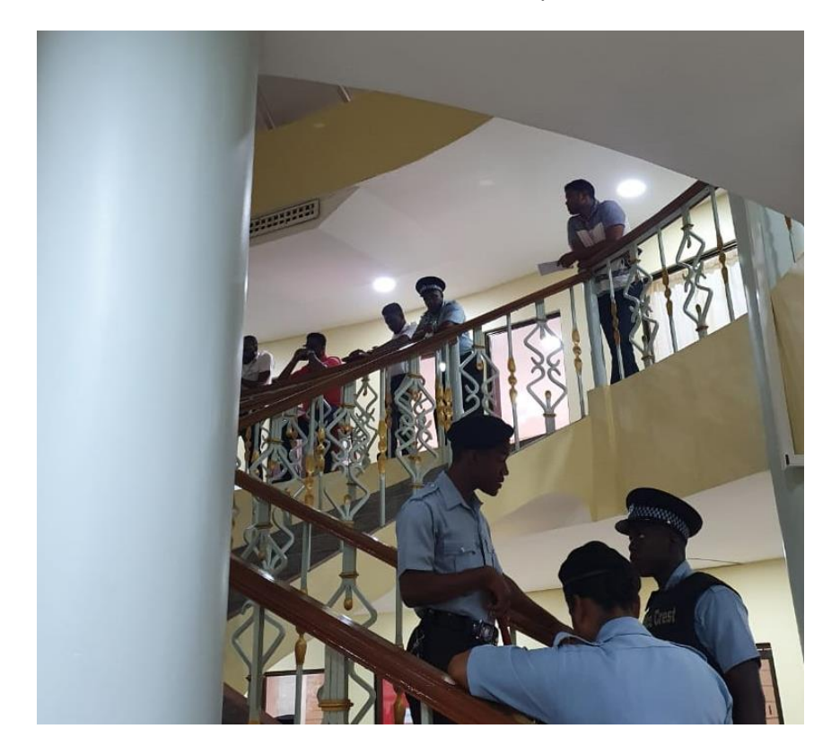
Court marshals waiting to serve injunction on March 5<sup>th</sup>, 2020

tabulation process pursuant to section 84(1) of the ROPA, not later than 11:00 hours on the 11<sup>th</sup> March, 2020.